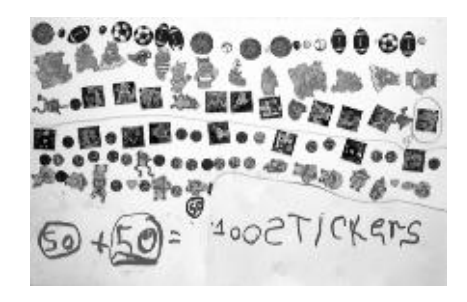
A collection of 100 stickers