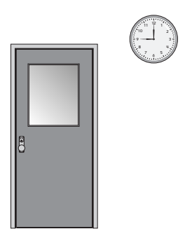
"I spy something that is round next to the door."